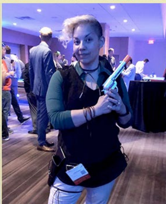
SciX evening event.