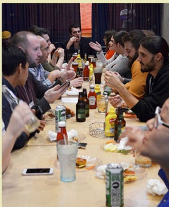
SAS Student Event.