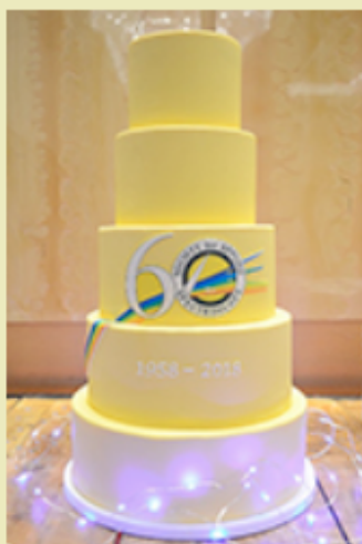
SAS 60th Anniversary cake.

The holiday season is here and we are sharing some SciX 2018 pictures with all our members and wish everyone a prosperous 2019!