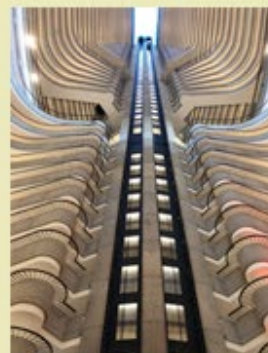
SciX 2018 was held at Atlanta Marriott Marquis, the highly patterned and symmetry interior design of which reminded many participants of various optic design elements employed in their own work.